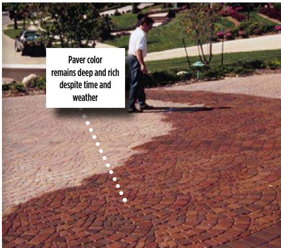
Paver color remains deep and rich despite time and weather