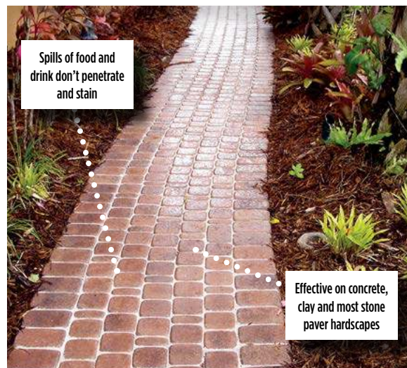
Spills of food and drink don't penetrate and stain